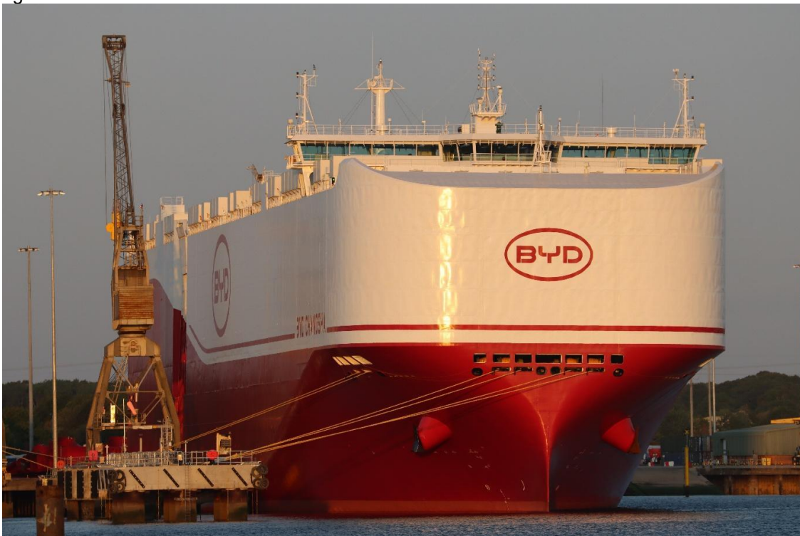
BYD Changsha operated by Chinese company BYD (Build Your Dreams)

This year has seen an influx of Chinese built and operated vehicle carriers, after a number of COSCO vehicle carriers the latest was the BYD Changsha, the sixth in a new class which with a capacity of 9,200 vehicles are classed as the world's largest.