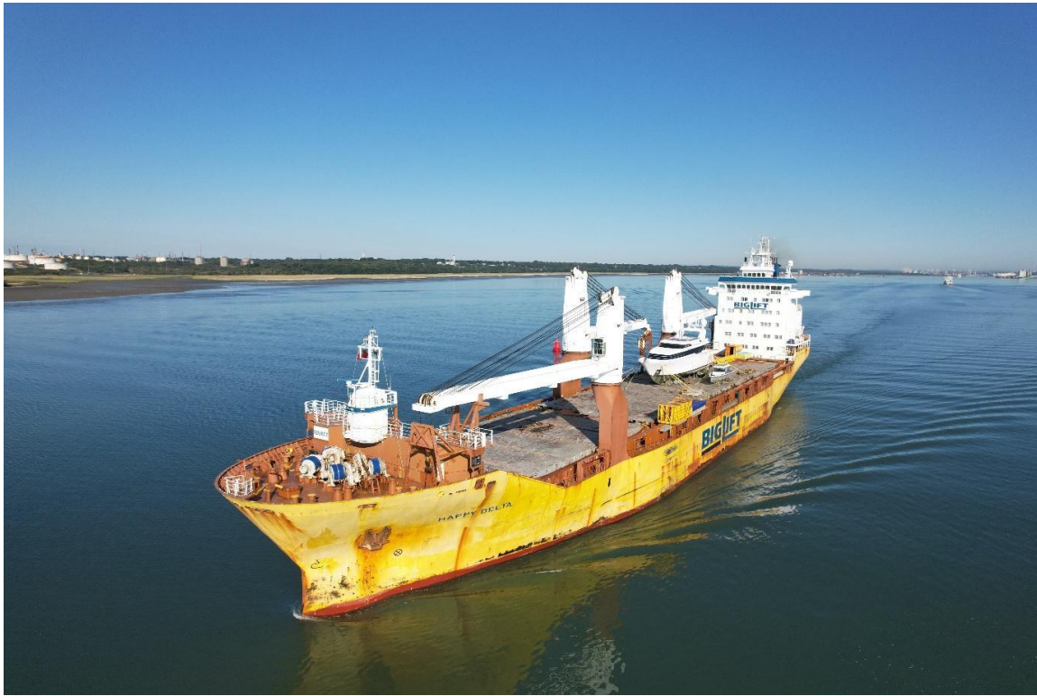
Big Lift Happy Delta seen sailing early 13th July.

This year has seen an influx of Chinese built and operated vehicle carriers, after a number of COSCO vehicle carriers the latest was the BYD Changsha, the sixth in a new class which with a capacity of 9,200 vehicles are classed as the world's largest.