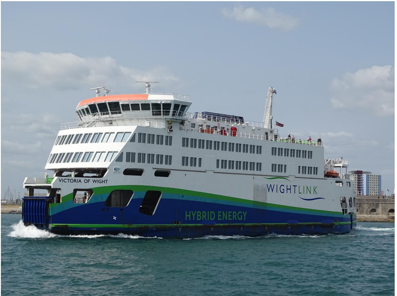
Victoria of Wight of Wightlink