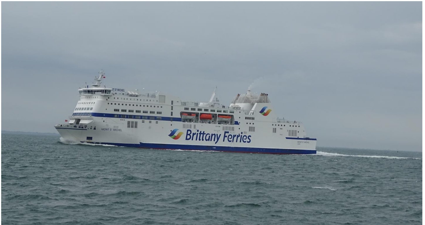
Mont St Michel of Brittany Ferries

Just before noon on Saturday 9th August, a man claiming to have an explosive device resulted in a 200 metre exclusion area being placed around a lorry at the Mayflower Cruise Terminal, which was evacuated and passengers were stopped from boarding the cruise ship Venfura alongside. Armed Police were called and Dock Gate 10 was closed whilst the lorry was searched with normal service being resumed around 2pm.