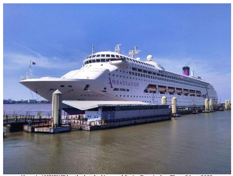
Above is AMBIENCE berthed at the Liverpool Cruise Terminal on Thurs 8 June 2023.

AMBIENCE is a cruise ship operated by Ambassador Cruise Line. The vessel was delivered to Princess Cruises in 1991 by the Fincantieri shipyard in Monfalcone, Italy as REGAL PRINCESS, sailing on their North American routes. After 2000 she was deployed on the company's Australian routes, then later in the Mediterranean and Baltic seas. In 2007 REGAL PRINCESS was transferred to P&O Cruises Australia, underwent major refurbishment, and was renamed PACIFIC DAWN, operating from Australia to South Pacific destinations. Her renaming coincided with P&O's 75th anniversary in Australia. It was intended that the ship would be retired in 2020, sold to Cruise & Maritime Voyages (CMV) and renamed AMY JOHNSON, but CMV had financial difficulties and went into administration in 2020, affected by the 2020 Covid pandemic. Later in 2020 PACIFIC DAWN was sold to Ocean Builders Central, and renamed SATOSHI. They intended her to become a floating residence in the Gulf of Panamar; however, after failing to obtain insurance for the proposed operation, she was resold in 2021 for operation by Ambassador Cruise Line, entering service as AMBIENCE in 2022.