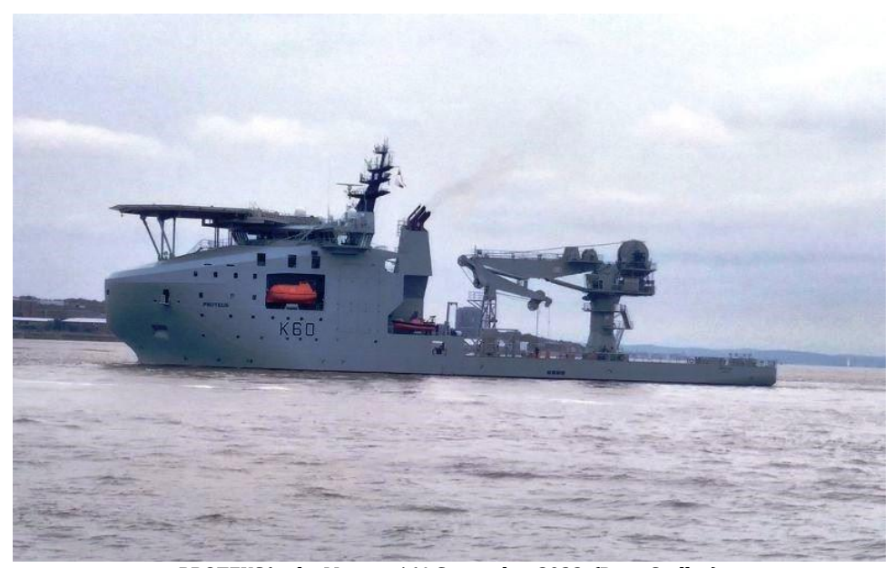
PROTEUS in the Mersey, 16th September 2023.

The UK's first Multi-Role Ocean Surveillance (MROS) ship RFA PROTEUS sailed from Birkenhead Saturday 16<sup>th</sup> September 2023 following conversion work. The vessel was purchased for £70 Million from Topaz Marine, a subsidiary of P&O Maritime and arrived at Cammell Laird for conversion to her new role in January. The MoD had promised she would be "operational in Summer 2023" but crew generation and safety certification issues are understood to have delayed her exit from the shipyard until now. After sea trials, PROTEUS headed to the south coast before she is formally named at a ceremony to be held in London during October.