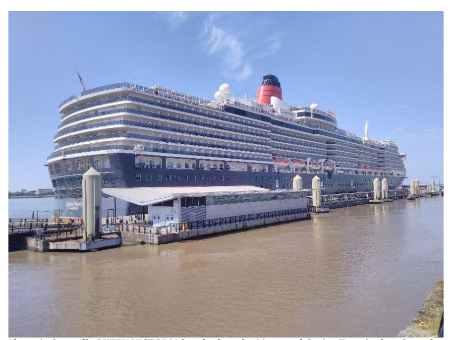
Above is Cunard's QUEEN VICTORIA berthed on the Liverpool Cruise Terminal on Saturday 3<sup>rd</sup> June. The purpose of the visit was to allow the Captain, Officers and guests to attend a Battle of the Atlantic 80<sup>th</sup> Anniversary Commemoration service of Remembrance at St Nicholas Church.

Following on from her cruises being cancelled during June and July because of the two broken swing bridges on the River Weaver, sadly DANIEL ADAMSON, stuck at Sutton Weaver, was unable to operate her River Weaver cruises on the 7/8 August as the bridges were still inoperable. However the vessel was able to operate her scheduled cruise on 5 August between Sutton Weaver and the Royal Albert Dock in Liverpool and the return sailing the following day as she had been turned by the tugs VIXEN and VITAL of Carmet Towing at Sutton Weaver so she was able to exit the Weaver into the Manchester Ship Canal.