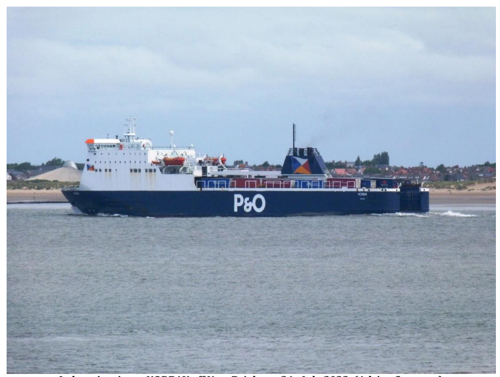
In happier times, NORBAY off New Brighton, 21st July 2022.

"I would like to express my gratitude to the employees, crew members, and partners who have contributed to the success of the Liverpool-Dublin route over the years. Their dedication and professionalism have been instrumental in serving our customers and maintaining our high standards of service."