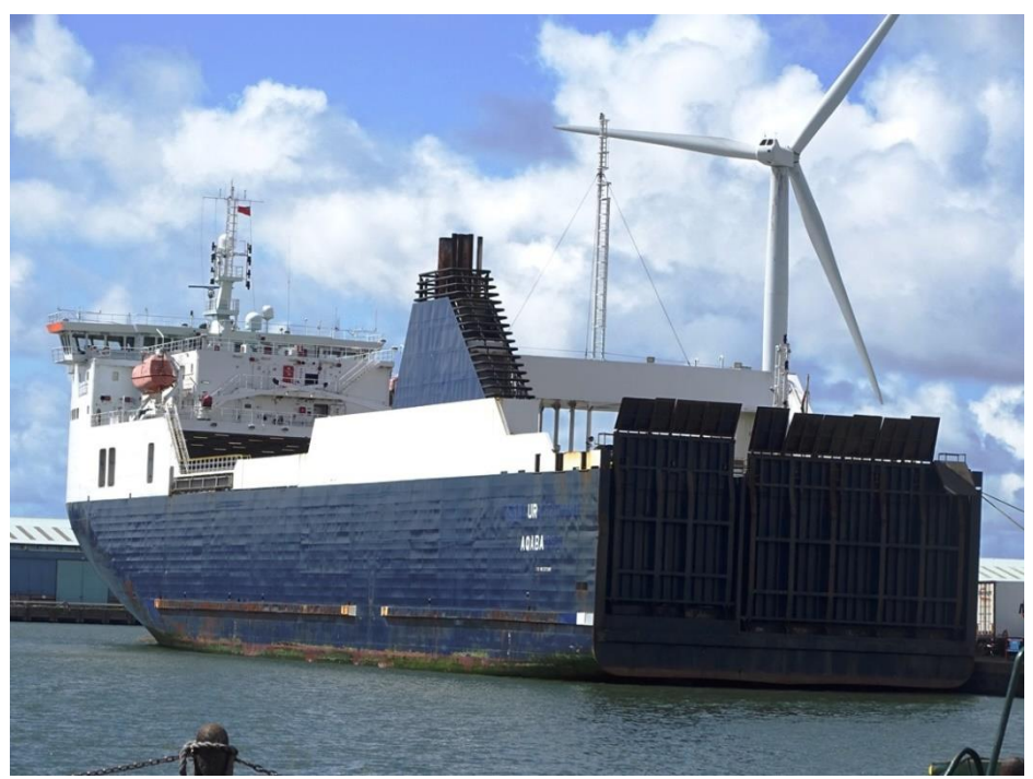
UR, ex SEATRUCK PENNANT, at Liverpool 6 Aug 2023.