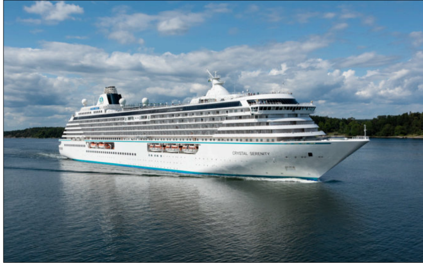
CRYSTAL SERENITY (2003) and fleet mate CRYSTAL SYMPHONY (1995) will be refurbished and restart service for Crystal Cruises in 2023.