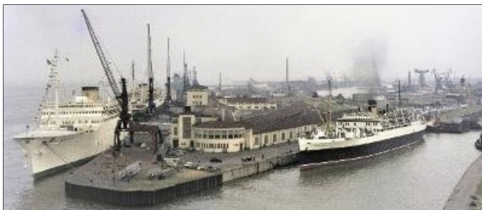
Summertime students head for Europe onboard the low-fare AROSA KULM; Bon voyage at Le Havre with the LIBERTE behind; Special occasion at Bremerhaven with the entire Arosa Line fleet assembled -- the AROSA SKY (far left), then the AROSA SUN and AROSA STAR behind and then (on the right) the AROSA KULM.