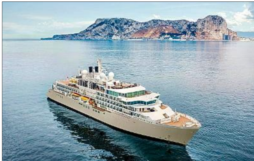
SILVER ENDEAVOUR (2021), as she will appear in her new livery in November 2022. (Silversea Cruises)