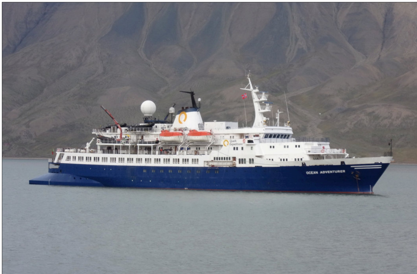
OCEAN ADVENTURER anchored at Longyearbyen, Norway on August 8, 2022.