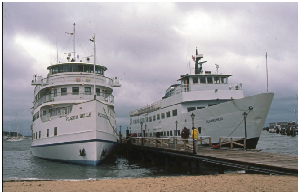
The PILGRIM BELLE (left), which also grounded off the Vineyard, is docked at Vineyard Haven next to SCHAMONCHI in this 1985 photo. SCHAMONCHI was the ferry that delivered QE2's First Class passengers to Newport after the grounding.