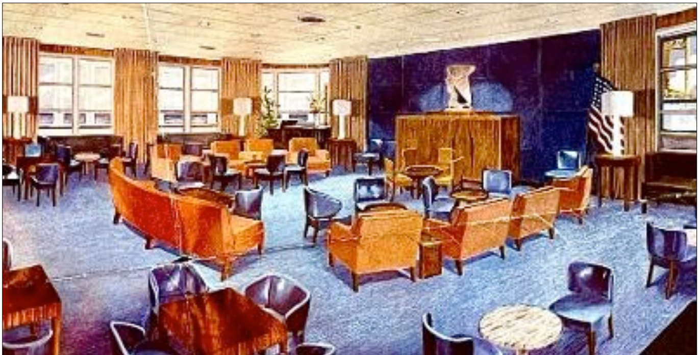
The simplicity and elegance of the main lounge is typical of Henry Dreyfuss interior design.