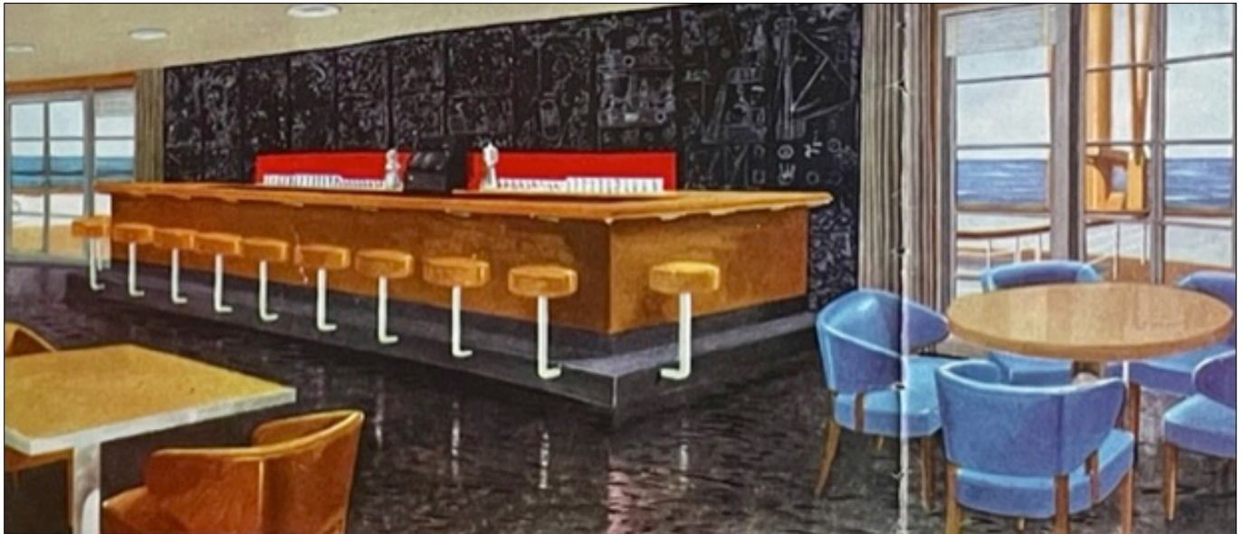
The 4 Aces' cocktail bar featured a Saul Steinberg mural depicting "the foibles of travel."

P.S. I have presented to Doug my shipping line request for a future program but we will all have to wait a bit for what he will choose. Stay tuned.