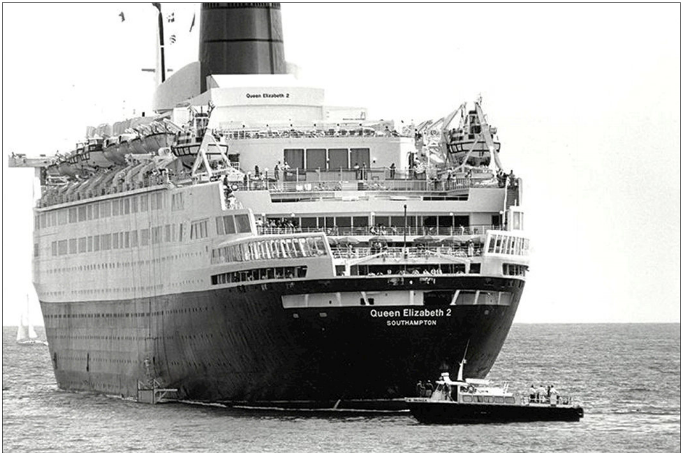
A stricken Queen Elizabeth 2 lay at anchor in Vineyard waters off Gay Head and Cuttyhunk in August 1992.

The "Atlantic Ferry," as the frequent transatlantic crossings once made by the "ships of state" of most European nations and the U.S. were known, was entering its waning years when the QE2 joined in. Legendary ships included Holland America Line's S.S. ROTTERDAM, Italian Line twins RAFFAELLO and MICHELANGELO, North German Lloyd's BREMEN, Swedish American Line's GRIPSHOLM and KUNGSHOLM, and Norwegian America Line's SAGAFJORD. Perhaps most notable were French Line's FRANCE of 1962, and United States Lines S.S. UNITED STATES of 1952. (QE2, by the way, is not named after the current British Monarch, but rather after a previous ship of the same name. Hence the Arabic rather than Roman numeral after QE. Cunard's current QUEEN ELIZABETH, launched in 2010, eschews the numeral altogether.)