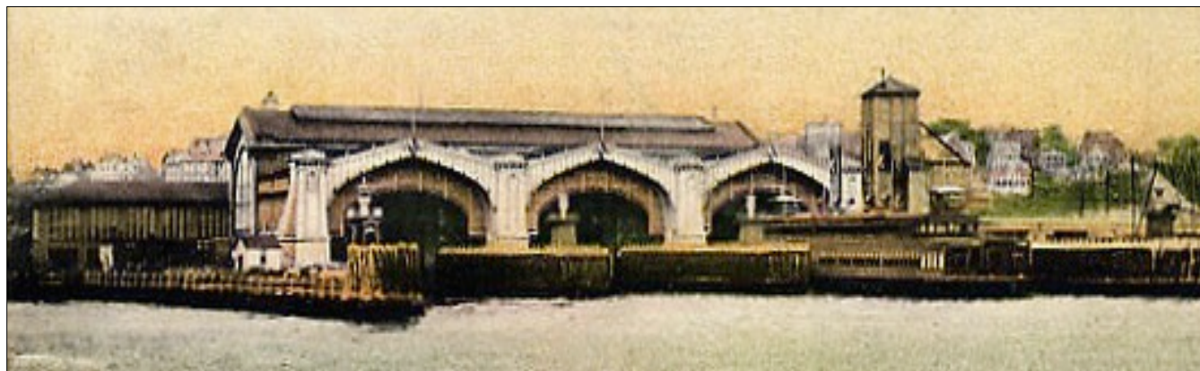
Images of the Staten Island Ferry and terminals in the late 19 th and early 20 th centuries.