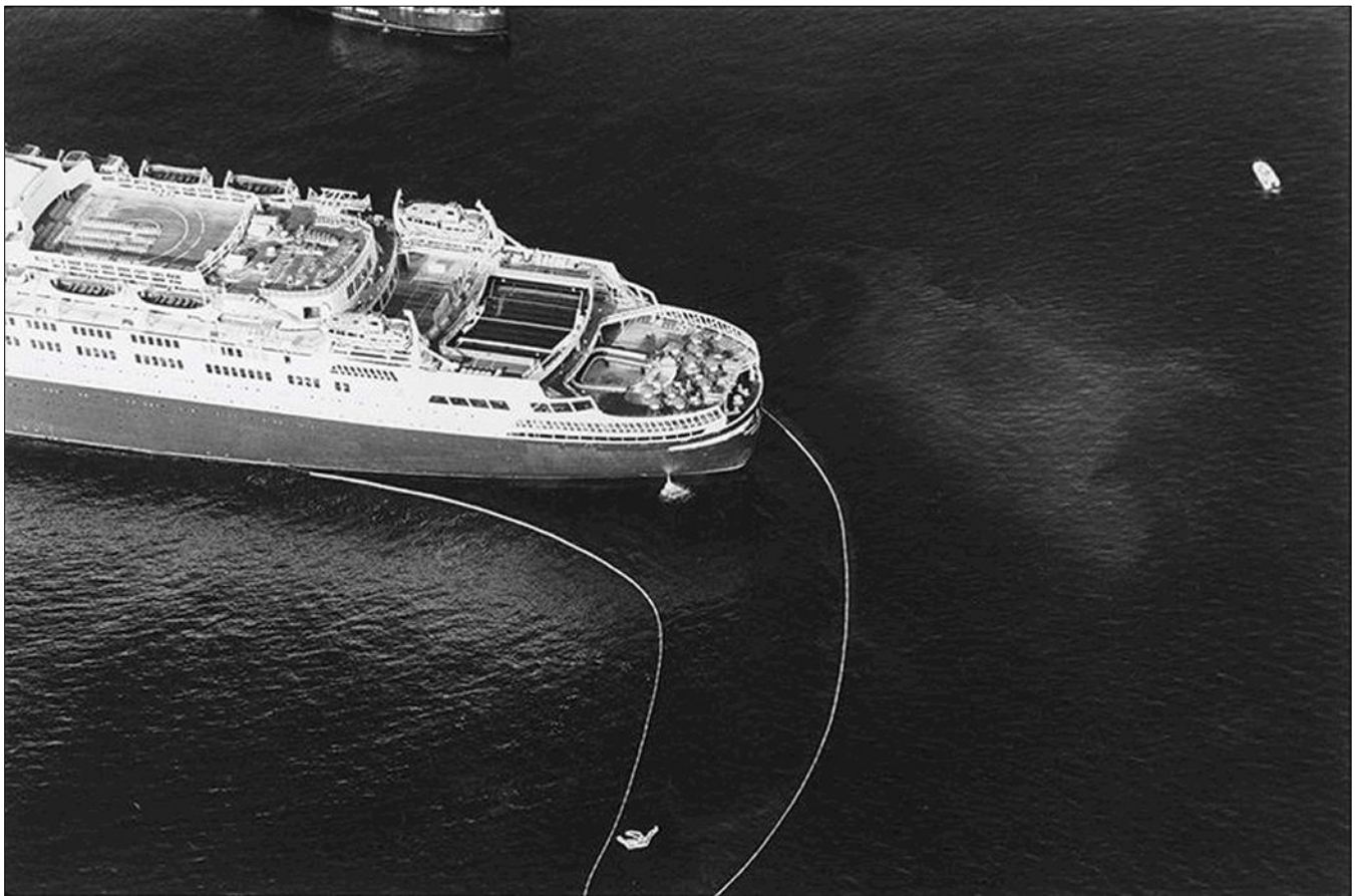
Booms were swung from the stern to contain oil spills, such as the patch seen outside the containment area, at right.

In 1823, another lighthouse was built directly across Vineyard Sound at the western end of Cuttyhunk. That lighthouse, which is now gone, served a similar purpose. The reef known as Sow and Pigs was noted (though not by that name) as early as 1602 by Bartholomew Gosnold, the first European to explore the Vineyard. Like Devil's Bridge it has been a graveyard for ships. Most notable, perhaps, was the whaleship Wanderer, which wrecked near the reef in 1924.