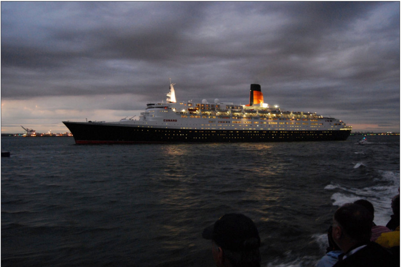
Despite multiple incidents and some negative press over the decades, QE2 was the most famous – and perhaps most popular – passenger ship afloat for nearly 40 years. She is seen here on her last departure from New York in October 2008.