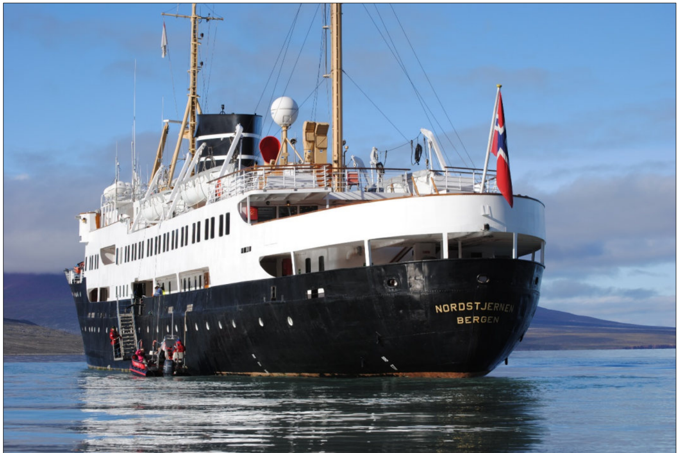
NORDSTJERNEN anchored at Longyearbyen, Norway in August 2022.