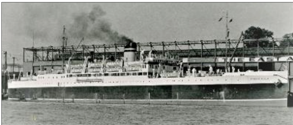
From top: The little AMERICAN BANKER departing from the 2nd Street pier in Hoboken in a view dated 1932; The AMERICAN BANKER loading cargo in the London Docks; After being purchased by the Arosa Line, the AROSA KULM was first painted in all-white; The AROSA KULM is seen berthed along the Long Dock, the 9th Street pier, in Hoboken.